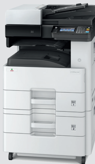
d-Copia 255MF with optional PF- 470 drawer