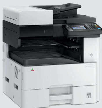
d-Copia 255MF in standard configuration